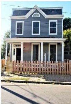
800 N 22nd St Richmond, VA