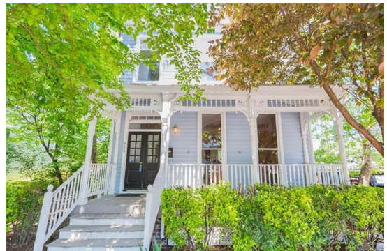
420 N 23rd St RICHMOND VA