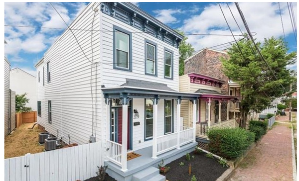
2119 M St Richmond, VA