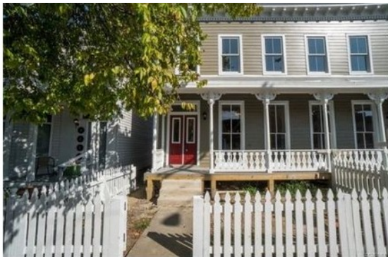
2220 Jefferson Ave Richmond, VA